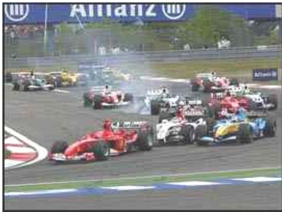
'First Corner of the Race'